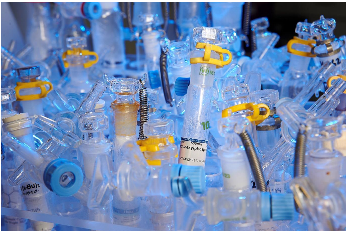
Fig. 1: New air- and water-sensitive catalysts are produced and stored in so-called Schlenk vessels under an inert gas atmosphere.